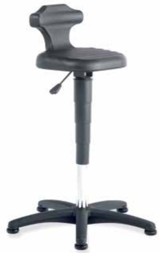
Flex 2 with glides Seat height adjustment range: 510 to 780 mm. Design Order no. Integral foam, black 9409-2000