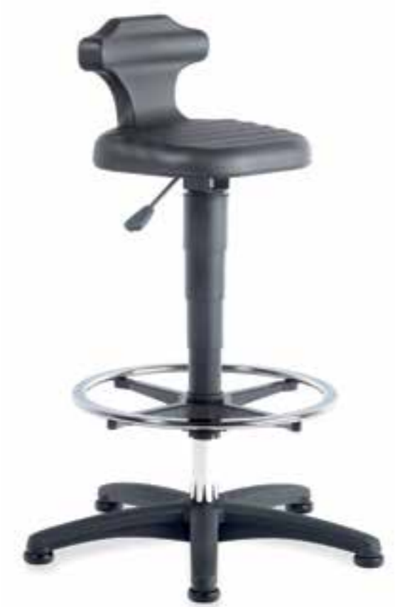
Flex 3 with glides and foot ring Seat height adjustment range: 510 to 780 mm. Design Order no. Integral foam, black 9419-2000