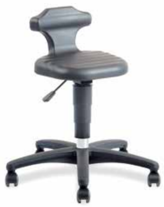
Flex 1 with castors Seat height adjustment range: 450 to 650 mm. Design Order no. Integral foam, black 9408-2000